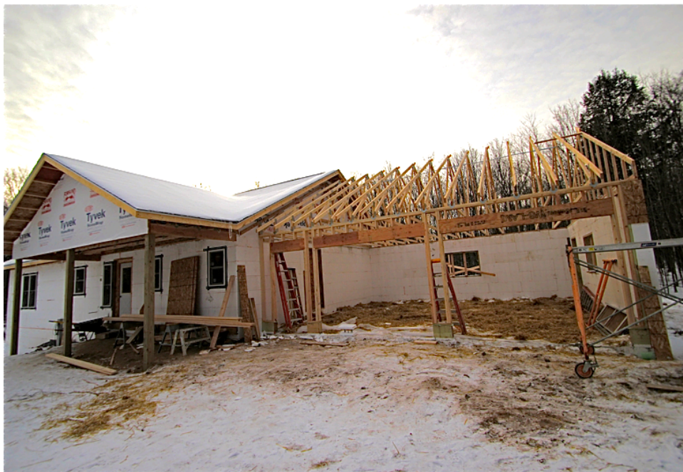
Front of Home Construction (January, 2012)

The home's design was developed among board members, Kjelstrom Architecture, Master Home Builders, and Covenant Point staff. Emphasis was placed on energy efficiency (ICF block construction), practicality, cost-savings, and hospitable spaces for guests and staff to gather. The site chosen on which to build is part of the camp's "Back 40" wilderness area - ideally located close to the main camp property and road, but with enough distance from the mainland area to be somewhat set-apart.