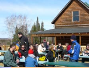
Lunch at the mid-mountain Homestead Lodge