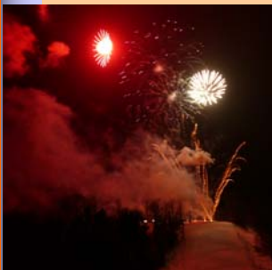
New Year's Eve Fireworks